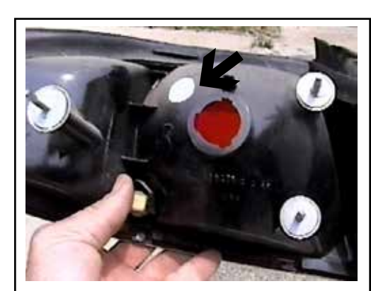
Location for the BX8869, (View of driver's side)

8. Remove four metric bolts from windshield washer reservoir with the 10MM socket to relieve opening in frame. Remove metric bolt from horn bracket with the 10MM socket and set aside.