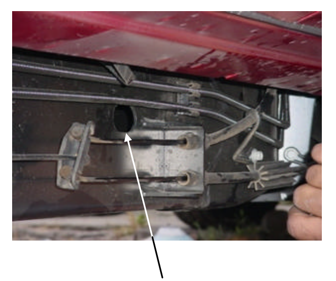
Insert in this hole the 1/2" bolt plate (Driver rear side)