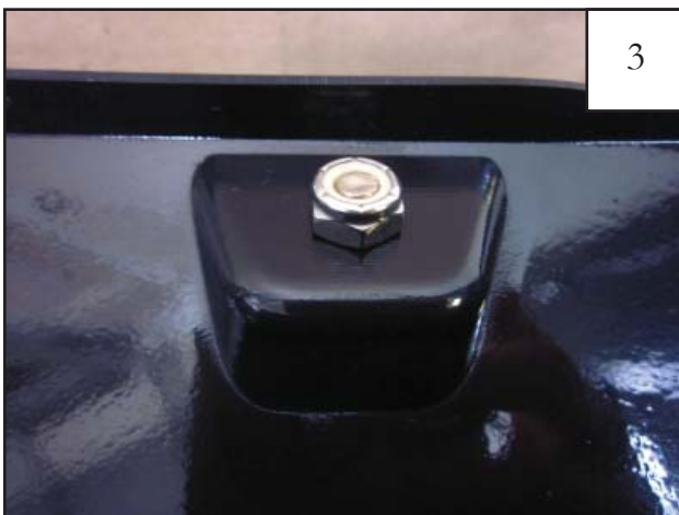
Place a Nut (NU1-0019) over the end of each Bolt and tighten, using a 1/2" wrench for the Nut and the supplied Torx Bit (SW1-0052) for the Bolt. Repeat for remaining pockets.