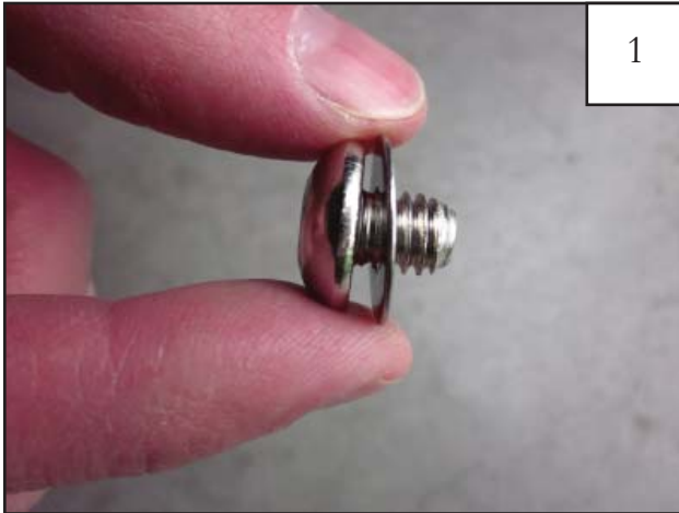
Put a Washer (WA1-0012) on each Bolt (SW1-0059).