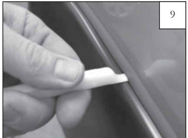
Using supplied Edge Trim Tool, seat edge trim against vehicle by hooking curved end under edge trim at one end of flare. Next, slide around outer edge of flare to the other end.