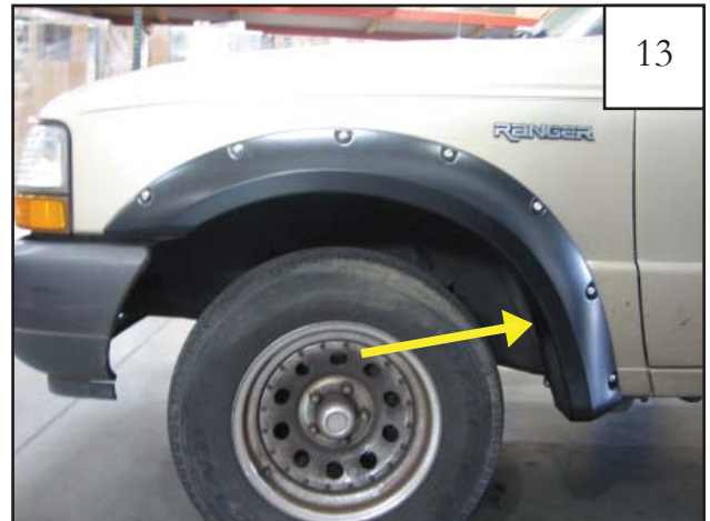
Start Screw (SW1-0050) into Clip (CL1-0006) installed in Step 11. Do not tighten.