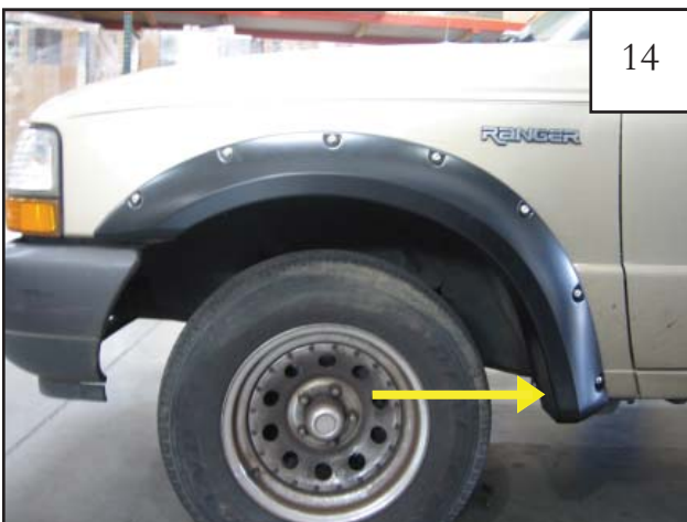
Reinstall factory screw saved from Step 8.