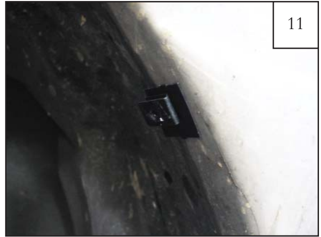
Install a Clip (CL1-0006) over the Tab installed in Step 10.