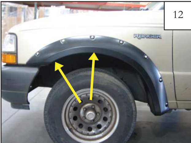
Hold flare in place and start Screws (SW1-0058) in Clip (CL1-0022) locations and into inner piece. Do not tighten.