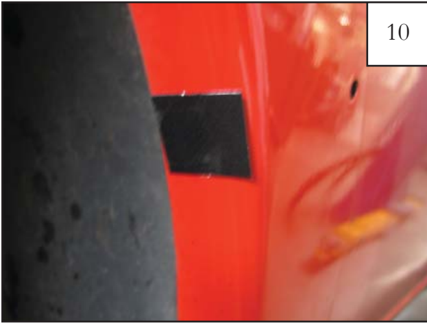
Install a Tab (MT1-0002) centered over mark made in Step 9. Edge of Tab should be even with edge of sheet metal.